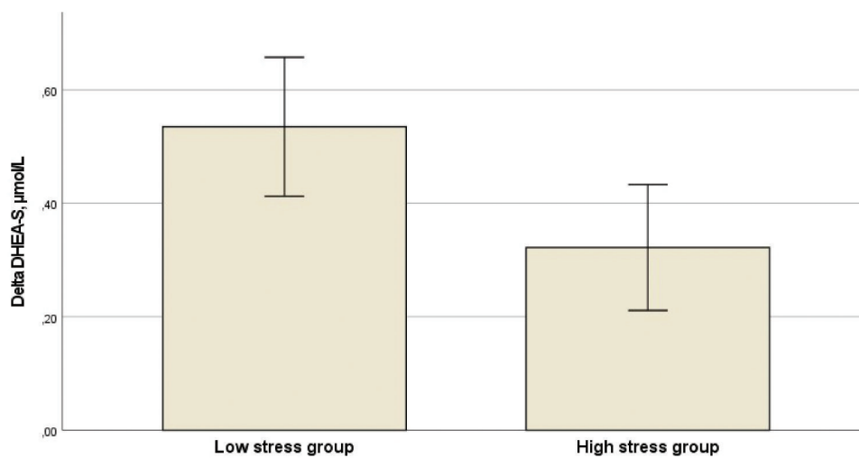
Figure 2. Delta DHEA-S (mean, 95% CI) in the low stress group and in the high stress group.

the PSS and DHEA and DHEA-S responses. They did not find significant relations between stress score and DHEA response (although the correlation coefficient was -0.34 ) or DHEA-S response. It is not clear whether there was enough variance of scores in PSS in the study group to be able to find a linear